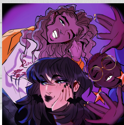
Digital illustrations by Nicole